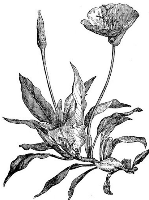
Oenothera speciosa L. Showy Evening Primrose